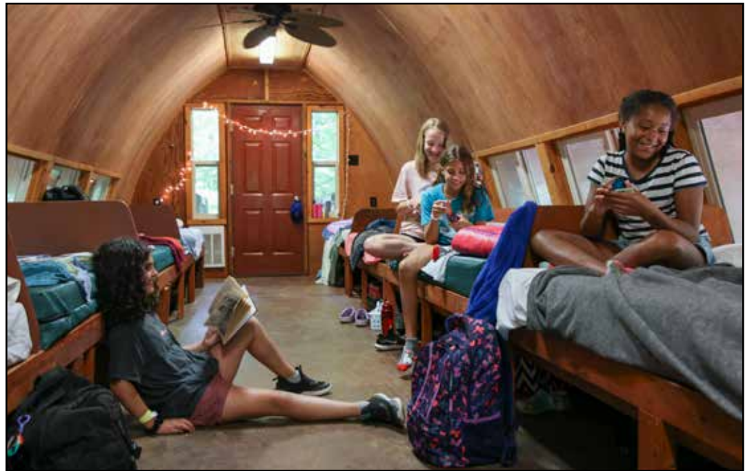
Campers enjoy quiet time together in their longhouse during a recent week of summer camp.

Formation by shared transformational experiences is the core of the second belief. Wherever they are, people are shaped by the experience they share with one another. The community-building and leadership skills practiced in Camp Hanover's small groups are experiences like no other, molding each child of God and equipping them for the world beyond camp.