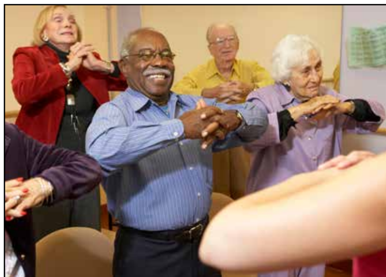
Residents who have outlived their financial resources can continue to live at Sunnyside with dignity and respect with help from New Covenant's endowment.