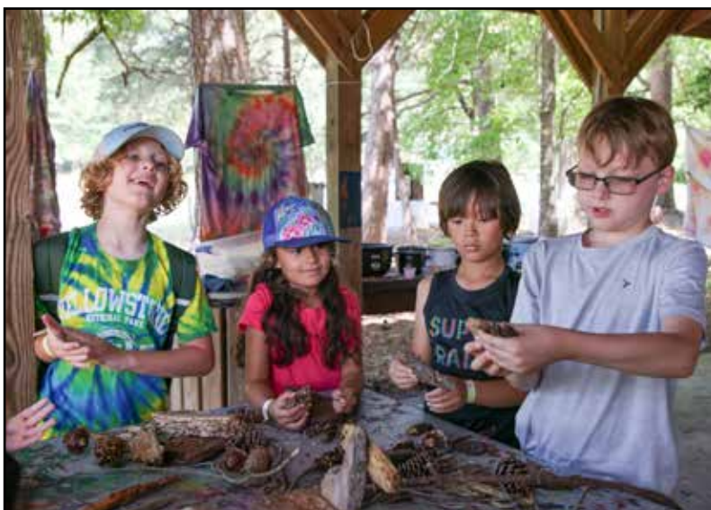
Making nature crafts is one of many activities kids enjoy at Camp Hanover. The endowment from New Covenant will allow more children to experience this special place.